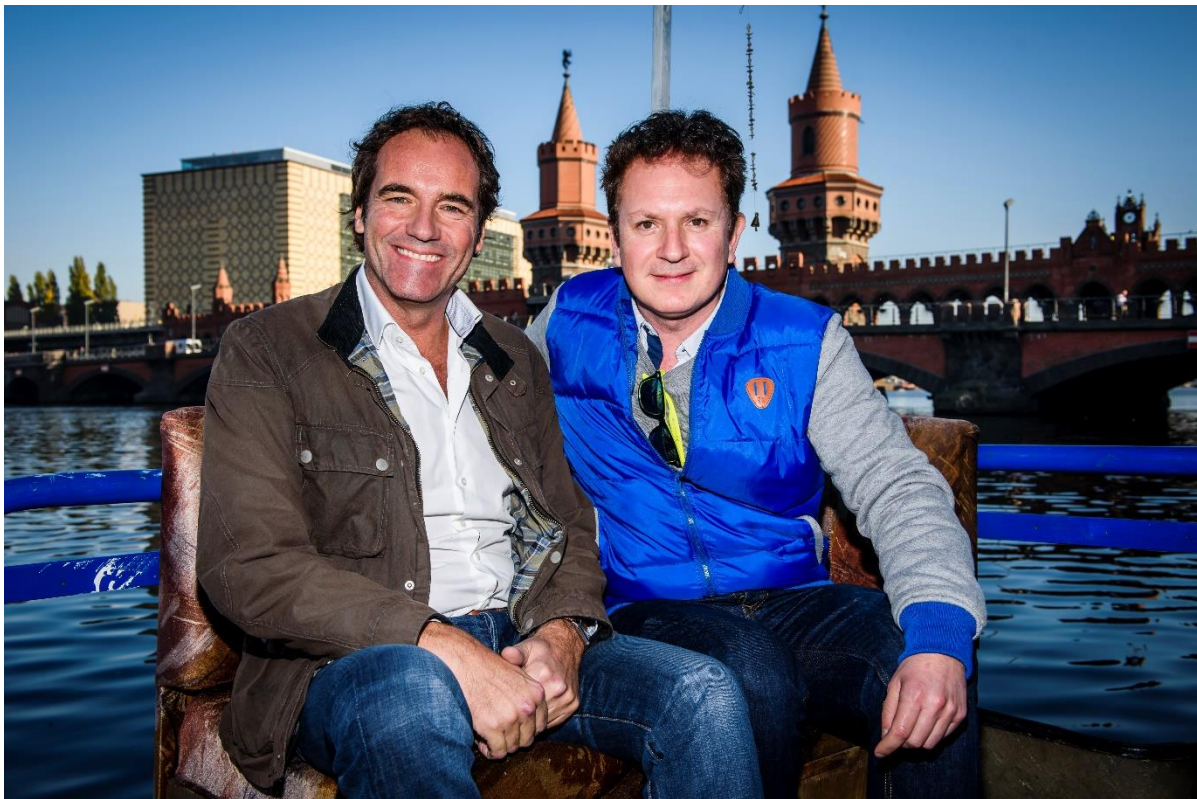
Second meeting at preview of HISTORY docusoap "Käpt'n Kasi - Auf hoher Spree" aboard a ship called 'MS Rhein' near Berlin's Oberbaumbruecke on November 3, 2015 in Berlin