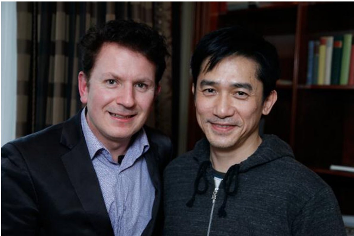
Photo of THE SPIRIT and Tony Leung Chiu-Wai