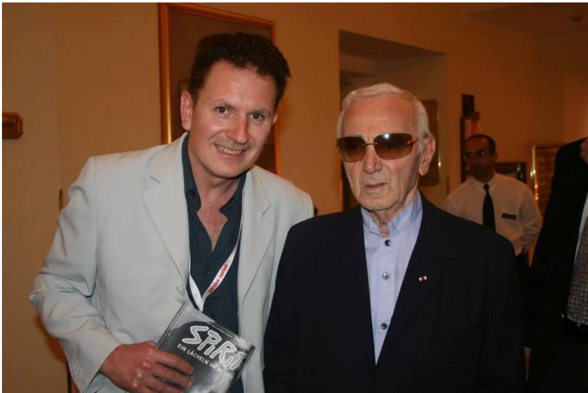
Charles Aznavour and Marc Spirit Hairapetian Hairapetian at the Royal Tulip Grand Hotel Yerevan on July 7th and 8th 2013