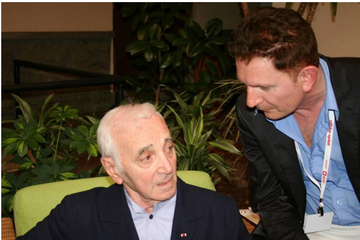
Charles Aznavour and Marc Spirit Hairapetian Hairapetian at the Royal Tulip Grand Hotel Yerevan on July 7th and 8th 2013